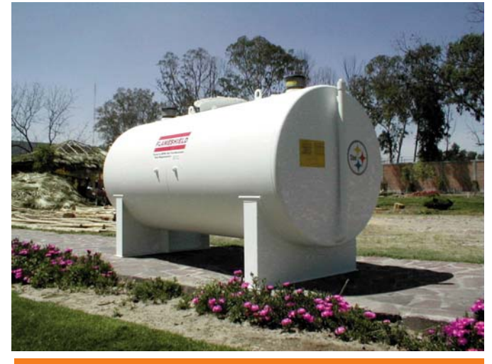
2-Hour 2000° Fire-Tested Performance

FLAMESHIELD<sup>®</sup> aboveground storage tanks are manufactured with a tight-wrap double-wall design. Standard features include 2-hour fire-tested performance, built-in secondary containment and interstitial monitoring capability.