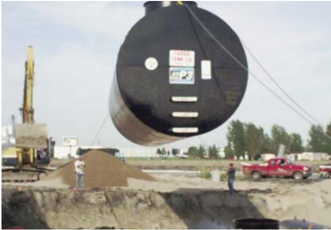
The only UST design which allows on-going monitoring of corrosion protection

sti-P 3 ® double-wall underground storage tank features a pre-engineered corrosion protection system that provides ongoing monitoring of corrosion protection. The sti-P 3 ® system has provided reliable, long-term performance for over a quarter million steel underground storage tanks.