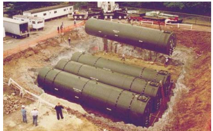
Compatible with a wide range of fuels and chemicals, including biodiesel and ethanol

PROTECT THE ENVIRONMENT. BUY RECYCLABLE STEEL TANKS.